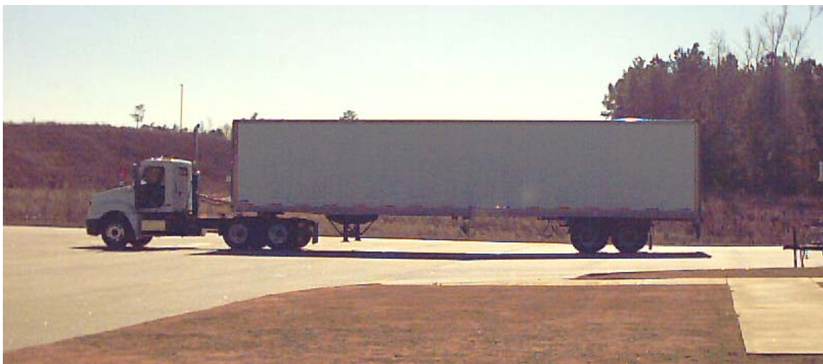
Figure 1 – Truck Configuration Used During the Testing Process

All fuel used was ultra low sulfur #2 diesel, verified by specific gravity at the time of testing. Any accessories that would have pulled auxiliary power were used in an identical manner in both tractors during all stages of Type II testing. Mirrors and windows were maintained in the same position for all stages of operation. Tire pressures were adjusted as necessary prior to the first test run on each day to ensure that all tires were within 5 psi of the manufacturers’ recommended cold inflation temperatures. Each tractor pulled standard cargo van trailers that were loaded to a GVW of 76,500 Lbs.